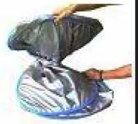
The Relax Sauna comes with a very comfortable insulated chair, and the tent folds easily.