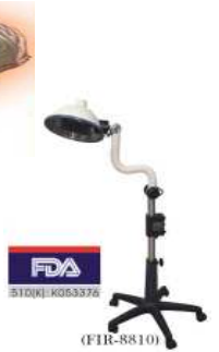
Sky Eye 800 Watt Radiator