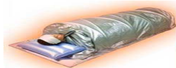
Lie Down Sauna