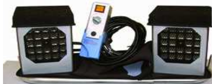
2 radiators -1500 watts generate 100% - FIR light 4-14 microns